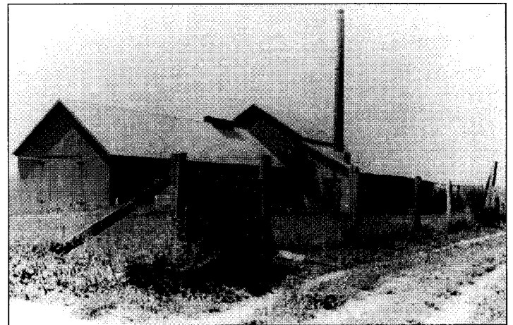
Kemp Packing Company built in Port Penn in 1890