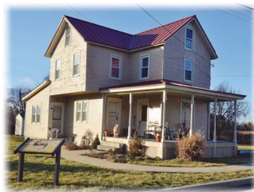
Hubbs House 2016

I feel grateful to be able to live in this very unique house, and continue to research the history of both the house and the people who lived there. As my daughter says, we're the only house around 'with a museum sign out front'. Stop by sometime and read the sign to learn more about the house!