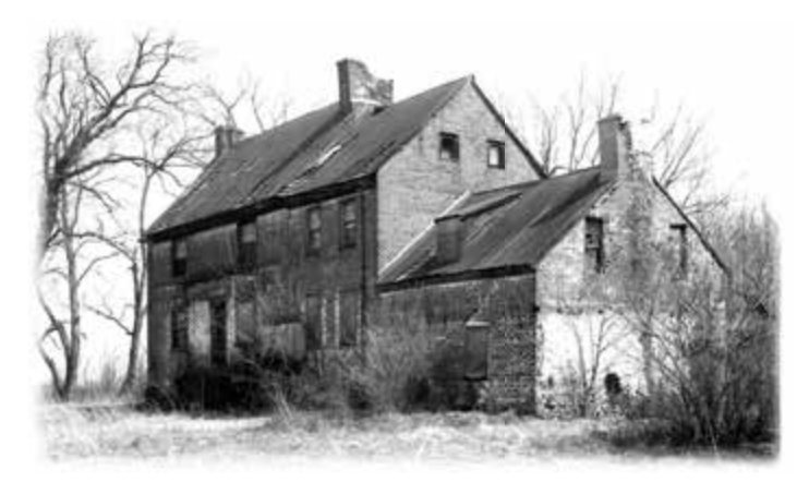
Figure 4 The Joseph Ashton House [3]

The John Ashton House consists of a brick, early-eighteenth-century main block and a frame wing. The original structure is a two-story, three-bay, hall-and-parlor-plan house with bricks laid in Flemish bond with glazed headers, with interior end chimneys in both gable ends. Attached to the west gable end is a five-bay, two-story frame wing at a lower level than the original structure. A chimney divides the wing into a three-bay section and a two-bay section.