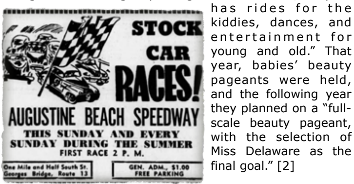
1951 Ad In 1951, the new

reputation except the name and the public beach. Today, boasting one of the largest picnic groves in the area, the park