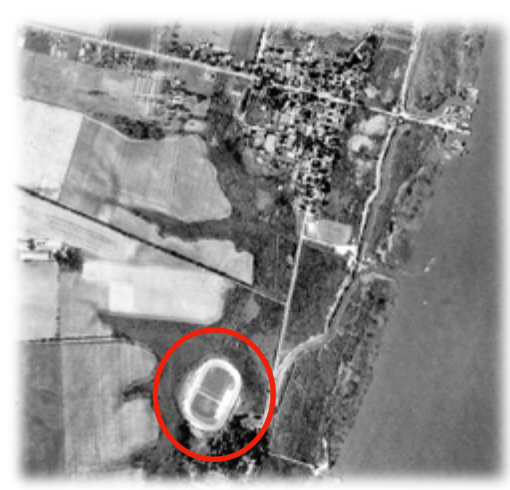
Aerial View 1954

Races were every Sunday during the season beginning at 2pm. 1 p m with а warmup. Featured drivers raced in a series of five races each event day, earning points for a series champion at the end of the season. The August 4 1951 Morning News "Top stated, daredevils from Delaware, Pennsylvania, New